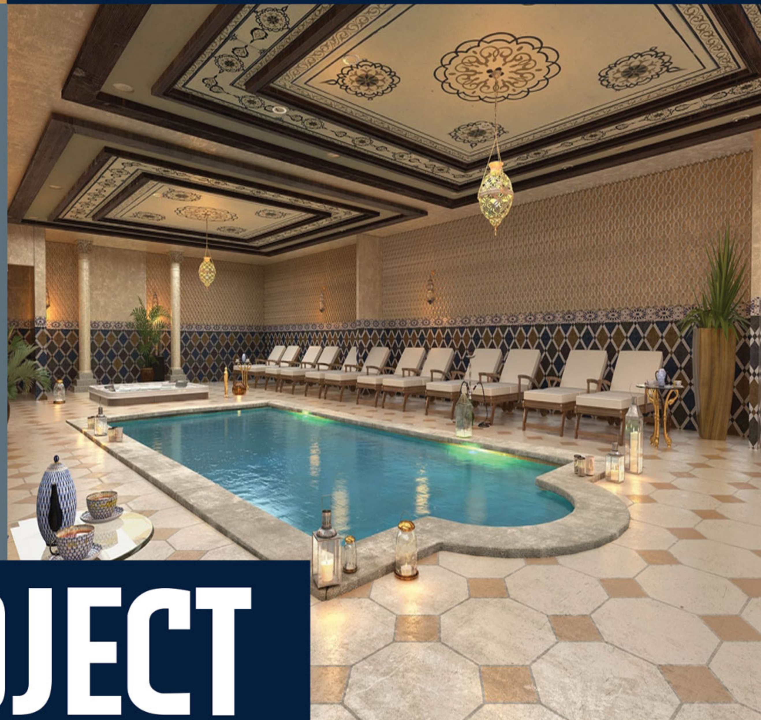
SWIMMING POOL AND SPA